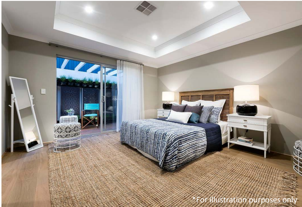
*For illustration purposes only