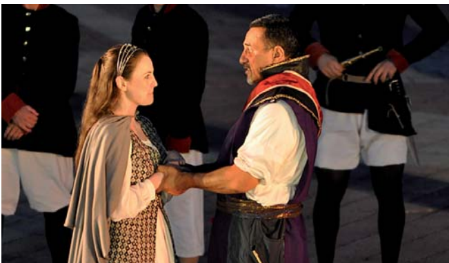
Othello at Woodlake Amphitheatre