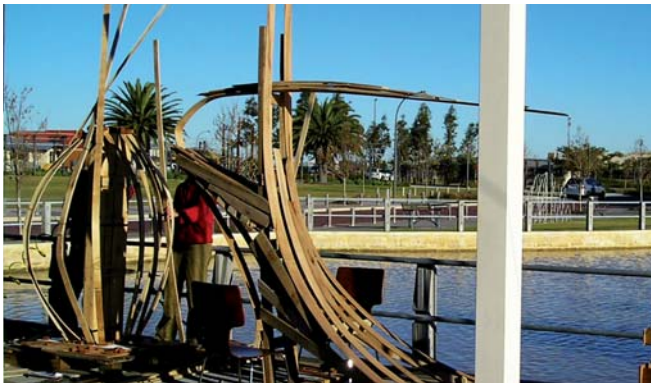
Fire Festival preparation at Charlotte's Vineyard

EA has three main goals – to initiate new cultural programs; to encourage and fund new and existing groups; and to develop the important cultural facilities needed for growth.